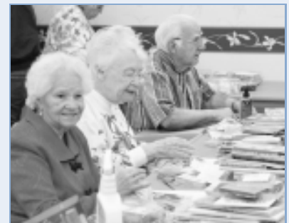
Volunteers clean books at the Henderson Senior Center.

We'd love to have you onboard as a volunteer. Visit SpreadtheWordNevada.org for more information.